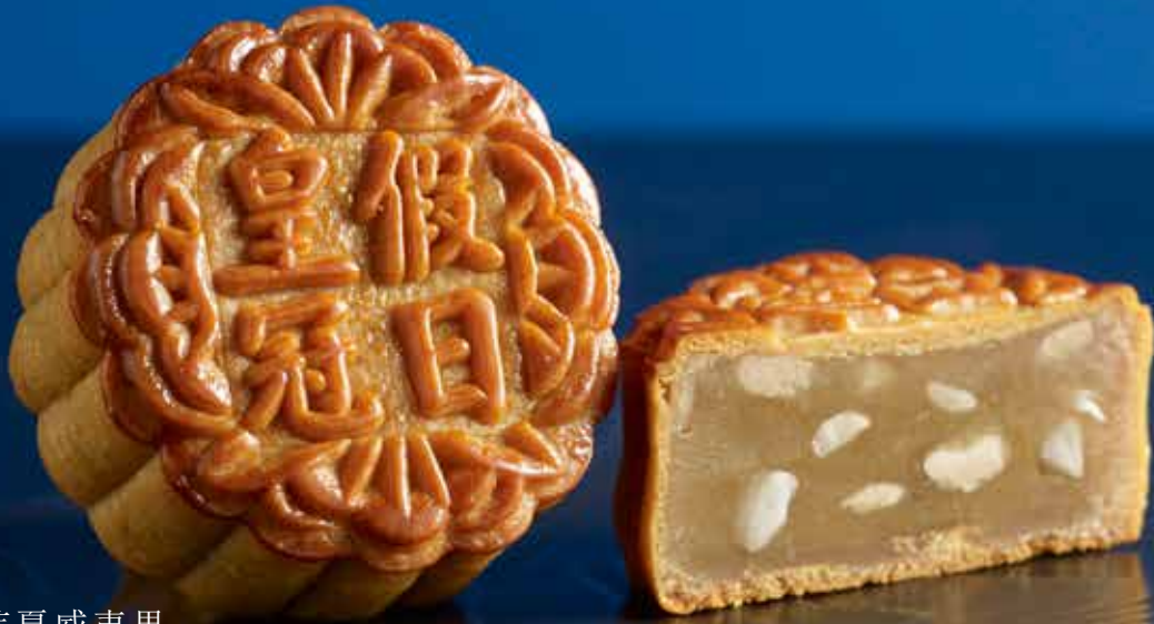
白蓮夏威夷果 LOW-SUGAR WHITE LOTUS PASTE WITH MACADAMIA NUTS