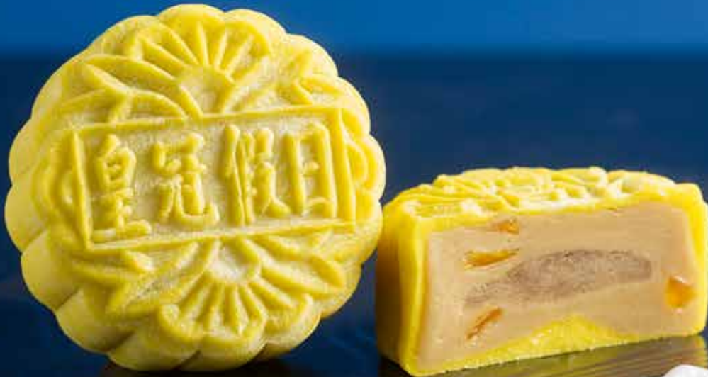
柚香芒果北海道牛奶 Yuzu Mango Hokkaido Milk